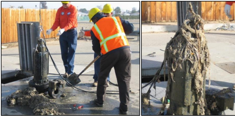
Wastewater treatment operators work on a pump clogged with wipes and other debris.

Water service providers around the world have experienced expensive problems due to inappropriate flushing of consumer products. These problems include clogged pumps, blocked screens, buildups in wastewater treatment plants, sewer blockages, an inability to effectively treat the products prior to their release to the environment and sewer overflows that can impact public health and the environment. In addition, utility workers are placed at undue physical and health risk when they remove these products from mechanical equipment and raw sewage.